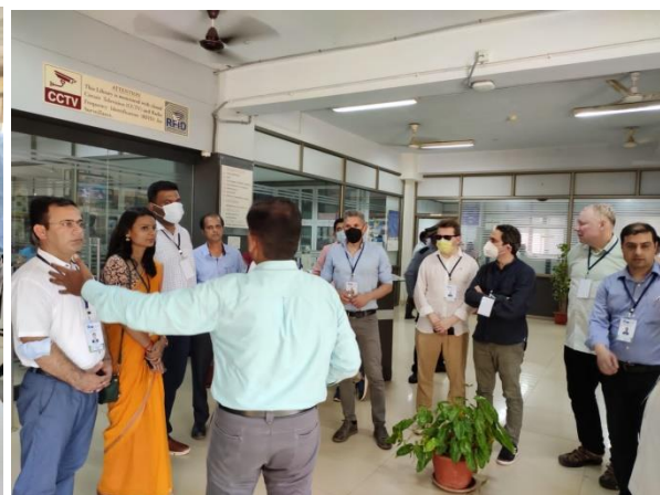
Understanding the foundation of the library