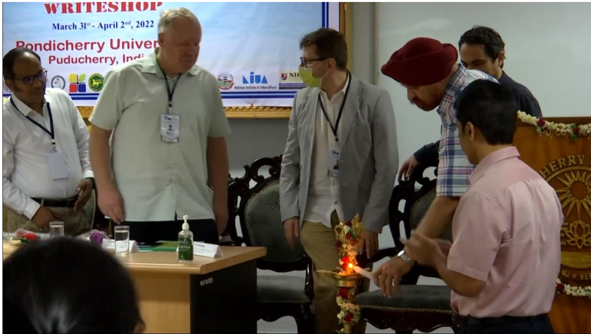
Guests lighted the lamp