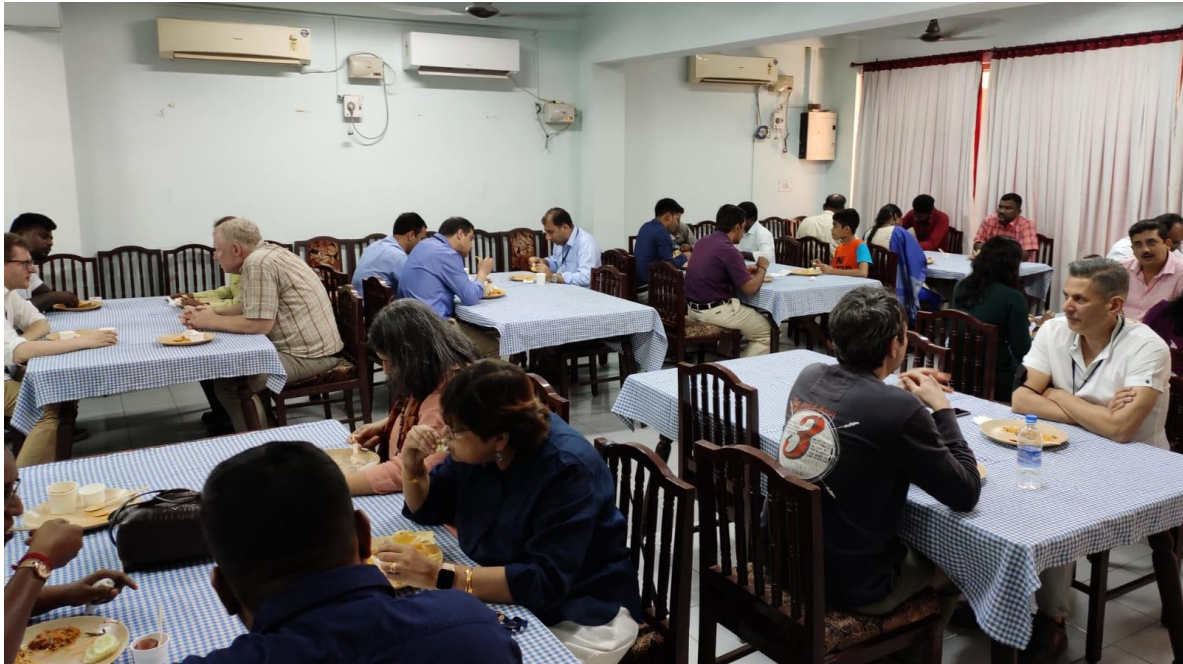
Discussion among the participants during lunch break

After returning from the campus visit, the participants had lunch, after which, according to the schedule, the meeting started. All the members got to know each other and shared their ideas and agendas during this session. The participants from the European partner institutions were keen to learn about the problems faced by states in India from where the participants belonged and the steps taken by the government, the gap between policy-making and implementation, and their role in solving the problem.