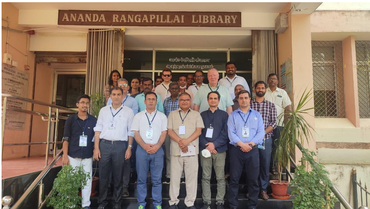
The participants with the librarian