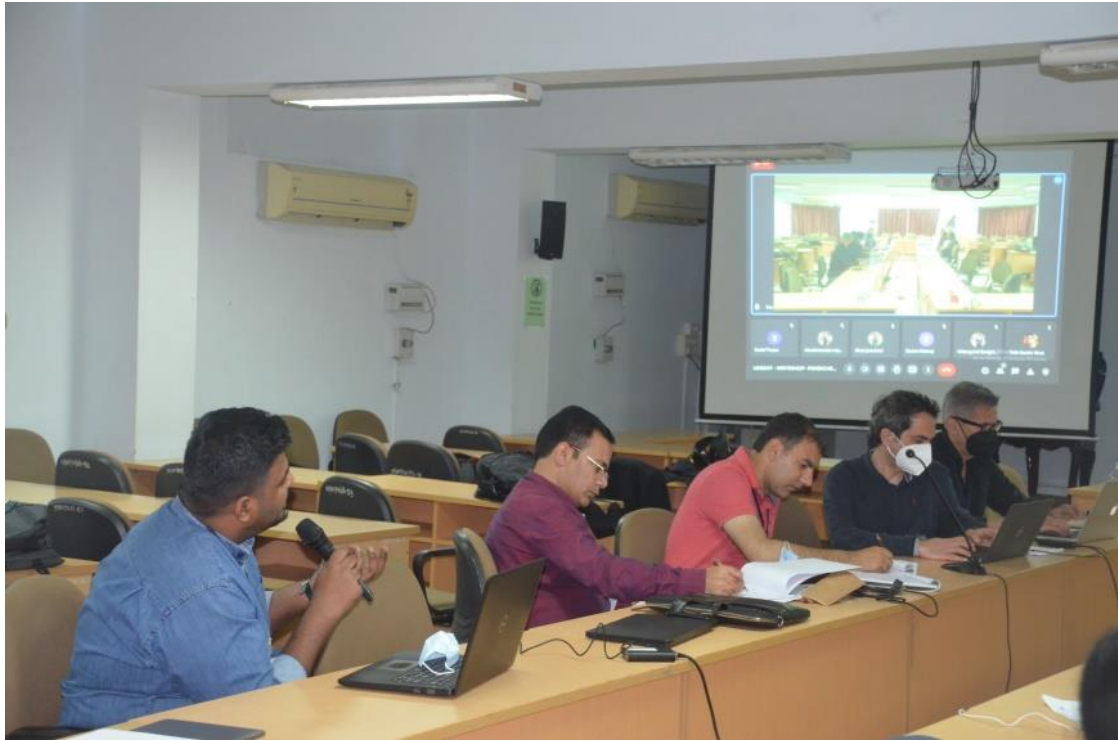
The questioning was done, and the members agreed on the other participants' suggestions.