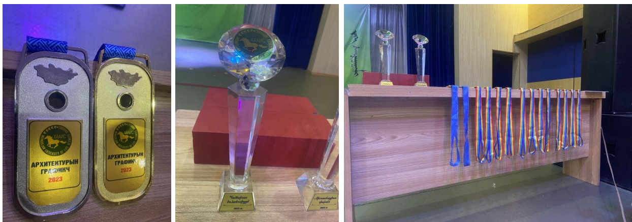
Figure 1. Awarded trophies, medals, and honors of competition.