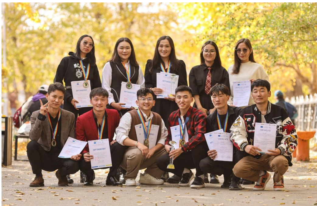
Figure 2. Awarded students of the Competition.

*The European Commission's support for the production of this publication does not constitute an endorsement of the contents, which reflect the views only of the authors, and the Commission cannot be held responsible for any use which may be made of the information contained therein